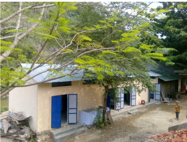
New toilet blocks at secondary school

The only secondary school in the Ca Dy Commune has nearly 330 students (including 220 boarders living at the school) and no functioning toilet for the last 5 years. The main primary school in Ca Dy has only two functioning toilets for 230 students. After learning of this dire situation, VNHIP decided to rebuild these decrepit toilets at these two schools, providing them each with 6 new toilets. Access to hand-washing troughs has been built into each toilet block.