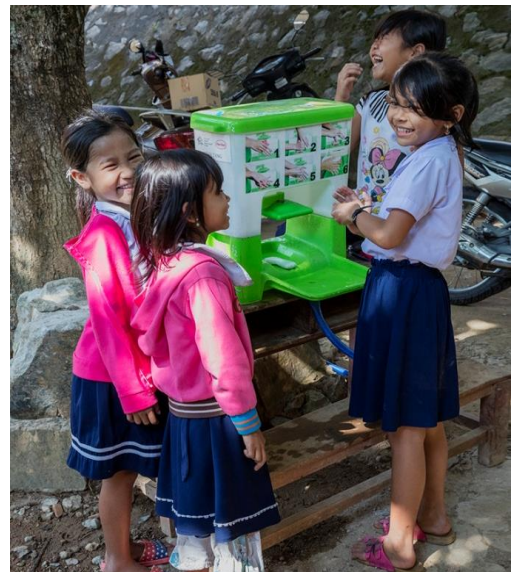
Water tanks also provide water for hand washing

We are very thankful to the Henkel Corporation and the Betula Foundation for their generous donations that made this project possible.