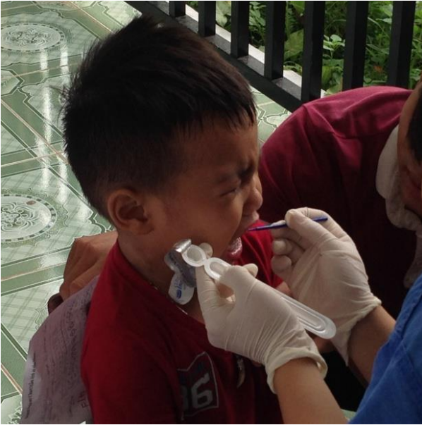
Fluoride was applying for all children

In May we conducted a dental outreach program in the Ca Dy commune of Nam Giang district. This was made possible through our wonderful partnership with East Meets West (EMW) Dental Center and a grant from the Australian Consulate in HCMC. Over 850 children were provided with dental hygiene education and free dental care, a feat made possible by the hard work and dedication of the VNHIP staff, EMW staff, eight overseas volunteers and students at Da Nang University. While there were some tears during the dental work, the children left with a smile.