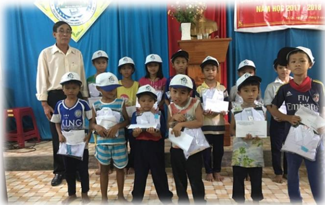
Scholarship for children with disabilities