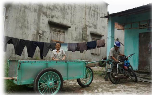
Livelihood for disability children family