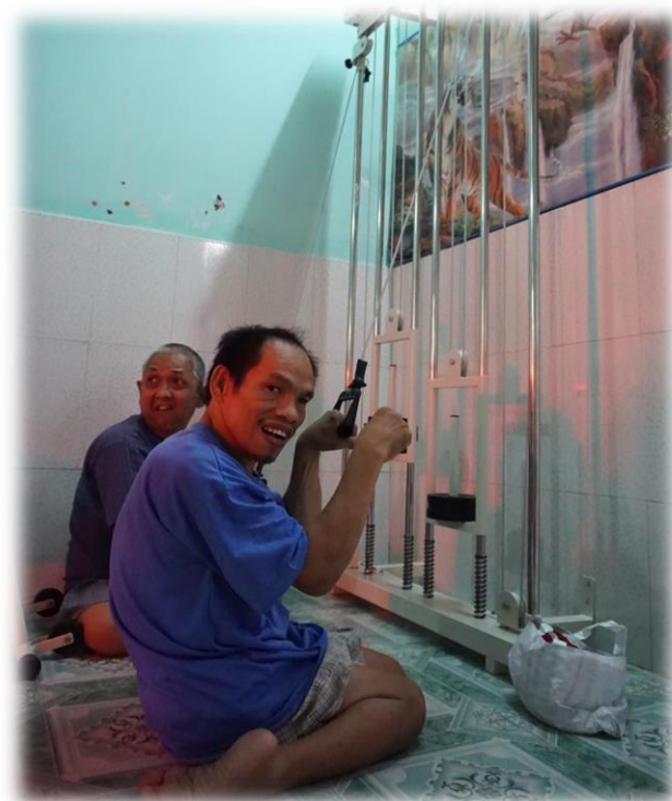
Rehabilitation devices at adult shelter